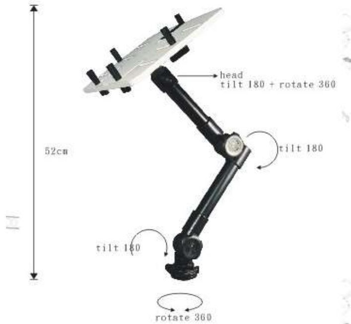
Aluminium 3-point Articulated Arm